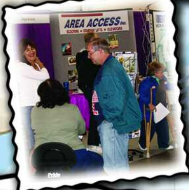
AREA ACCESS Inc.